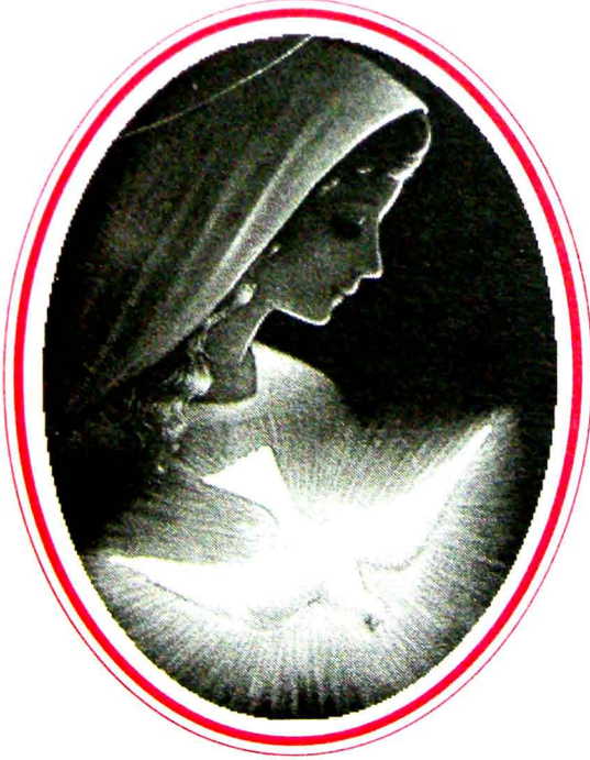
IMMACULATE SPOUSE OF THE HOLY SPIRIT