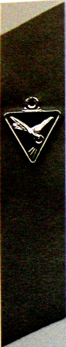
MEDAL OF THE FSMA